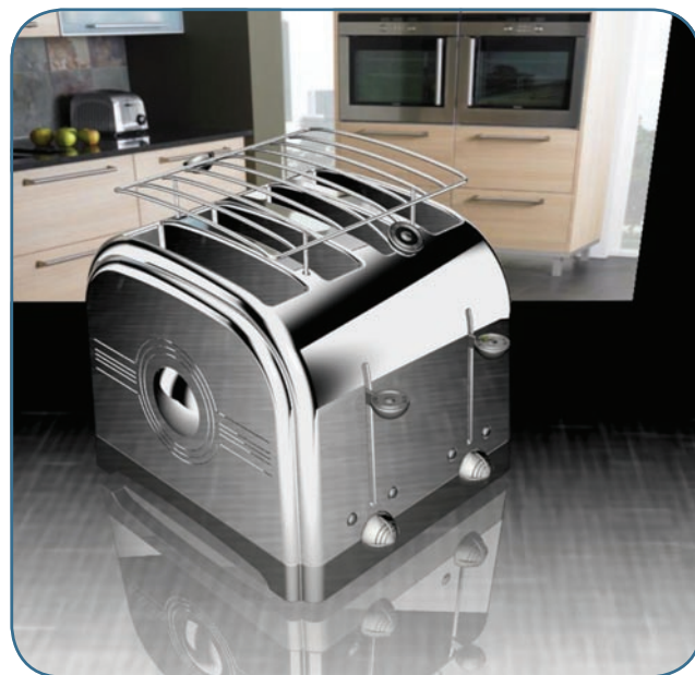
Pro/ENGINEER gives you the power to add shadows and reflections to your photorealistic images, so you can make your product designs come to life.