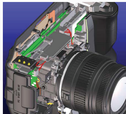
Build prototypes including 3D parts, assemblies, sheet metal components, standard or supplier parts, and cable harnessing.